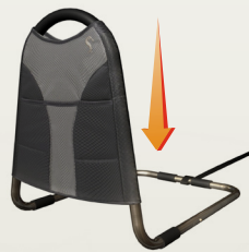
Slide on Organizer Pouch