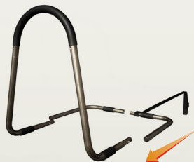
Slide On Safety Strap And Attach Base Tubes to L-tubes