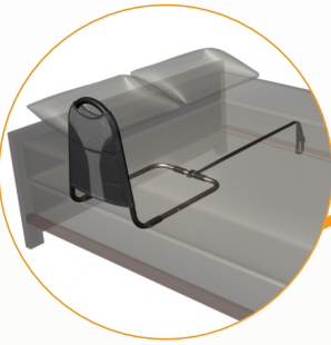
Secures to Any Home or Hospital Bed With Included Safety Strap