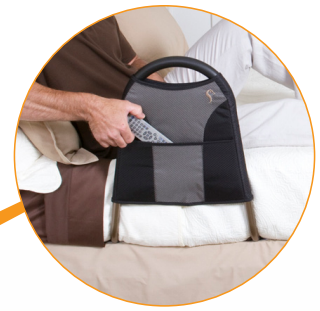
Includes Padded Organizer Pouch