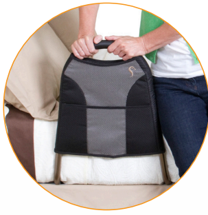
Ergonomic Handle Provides Support