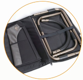
Easily Fits into Included Carrying Case