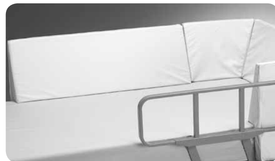
Horseshoe Wedge (5730) joined with optional Side Rail Wedge (5708)