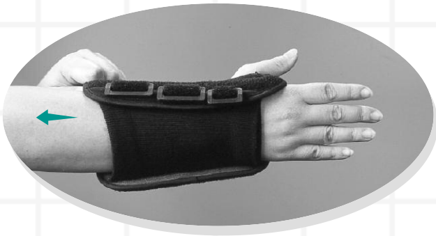
1. Position hand in brace.

Care: Hand wash using mild soap. Rinse thoroughly. Air dry only. Do not tumble dry.