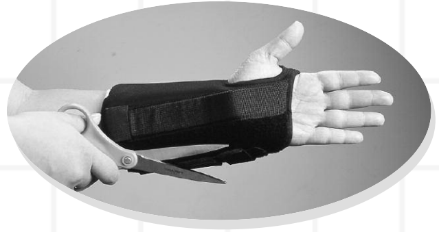
5. Trim excess strap material.