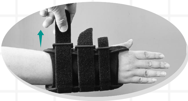
3. Pull straps through "D" ring.