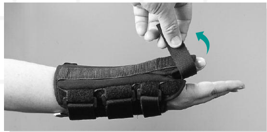
Additional step for UNO WHT 6. Secure thumb strap and trim extra strap material.