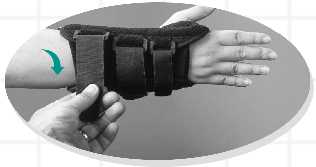
4. Secure the straps.