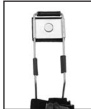
Slide up for PIP