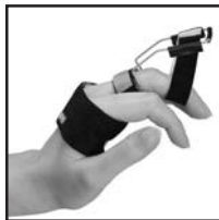
3pp™ Step Up™ Splint

Reduce lateral deformities of the PIP and DIP joints.