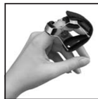
3pp™ Step Down™ Splint