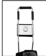
Slide down for DIP