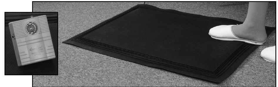
Figure 2: Typical usage with Alarm Floor Mat (#71895 and #71896)

DO not use if alarm fails to sound during the test. If the alarm unit is dropped retest before use. Figure 2.