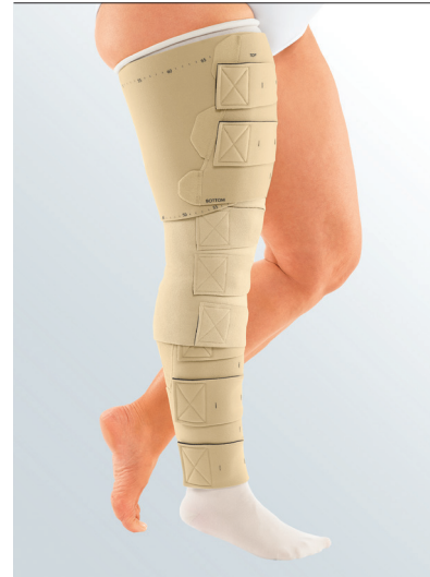
circaid ® reduction kit whole leg with undersock