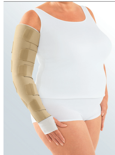
circaid ® reduction kit arm with undersleeve