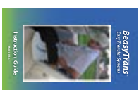
BeasyTrans Instruction Guide SPN#1511

For price and ordering information, call 1-877-992-3279 or visit our web site at www.BeasyBoards.com and order online.