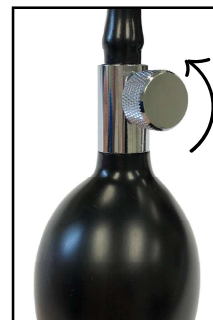
Turn Valve Counterclockwise Slightly

6. Record results: Take at least two readings, 1 minute apart. Record results. If blood pressure consistently appears elevated (above approximately 120/80), contact a health care professional for advice.*