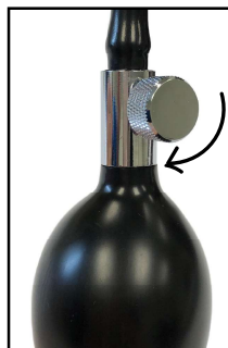
Turn Valve Clockwise