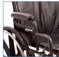
Removable, desk length, padded arms

The ProBasics K7 Heavy Duty Wheelchair features a robust design to accommodate patients with wider seat and higher weight capacity requirements. With seat widths from 24 to 28 inches, a weight capacity of 450 - 600 pounds and a heavy-duty slide tube frame, the ProBasics K7 offers a rugged yet attractive option for the bariatric patient population.