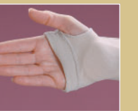
Carpal Gel Sleeve