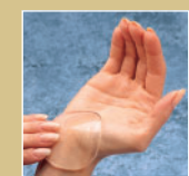
Carpal Gel Pad