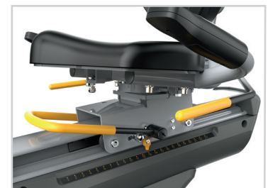
One-hand Seat Adjustment