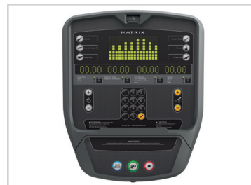
Dot-matrix with Profile Display