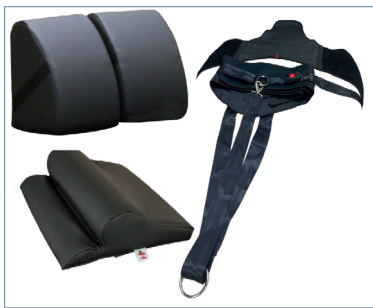
Knee & Cervical Bolster Set and Traction Belt