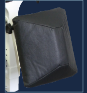
Elevated torso cushion