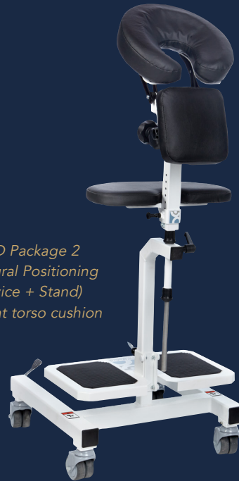
EPD Package 2 (Epidural Positioning Device + Stand) with flat torso cushion