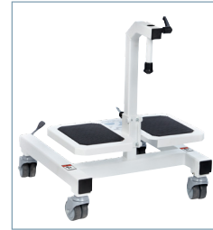
LDS - EPD Stand