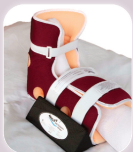
Optional Anti-Rotation Wedge for Foot Rotation (sold separately)

Consult Instructions for Use for Customization and Cleaning Instructions