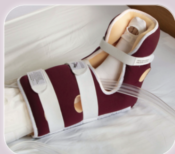
SCD Tubing for DVT Prevention