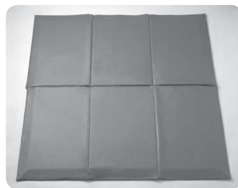
Connect two Floor Cushions to create a wider area of coverage

NOTE: Due to the random possibility of falls, the Posey Company makes no guarantee, express or implied, that the user is protected from hip trauma.