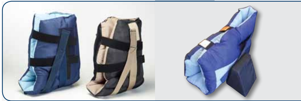
0815-67-981 Navy Blue/Light Blue 0815-67-973 Black/Tan

Compare for yourself and see why the Rolyan® Heel Boot is the right Off-Loading Device for your patients.